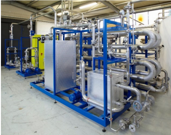
Image: EnviroDTS SteriFix E15000 wastewater sterilisation plant for safe inactivation of active components in wastewater.