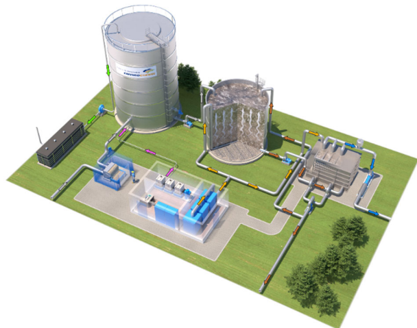
Image: Example of a biological Biomar membrane wastewater treatment plant with mixing and expansion tank, aerobic cleaning step and membrane filtration unit.

The permeate resulting from the reverse osmosis is to be sterilised via a UV system so that it can be utilised again in production. “The entire plant is designed in such a way that the concentrate from the reverse osmosis complies with the discharge values,” explains Billenkamp. This applies in particular for the COD limit value of 150 milligrams per litre.