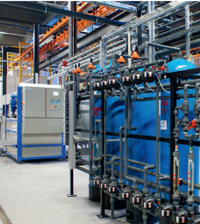
Decentralized, process-integrated wastewater treatment plant and water recycling for the automotive industry.