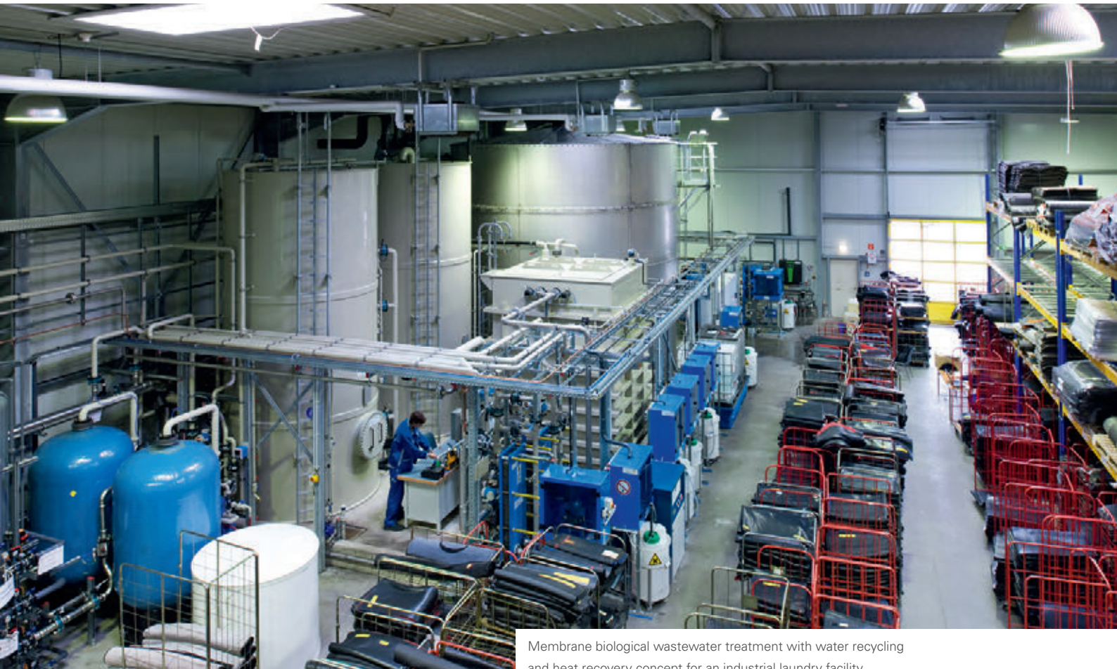
Membrane biological wastewater treatment with water recycling and heat recovery concept for an industrial laundry facility.

As a result, the person responsible for wastewater treatment in a company always requires a tailored solution. And above all else, this solution must be efficient.